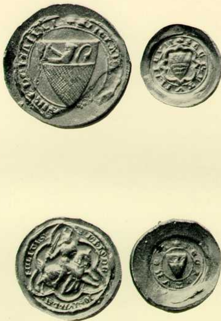
SEAL OF JOINVILLE